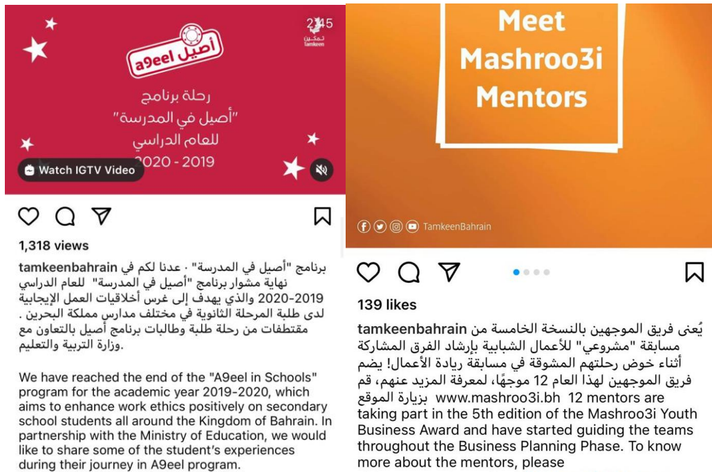
Figure 4. Example of project logos in Arabizi a9eel (أصيل) and mashroo3i (مشروع) in Bahrain