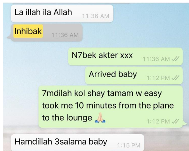
Figure 5. Different Arabizi spellings for (نحبك) = 'I love you': Inhibak / N7bek .